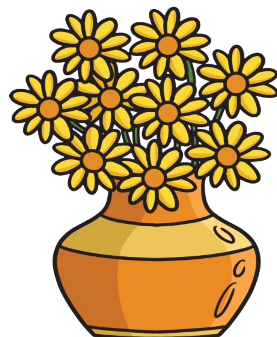
Flower wash 1