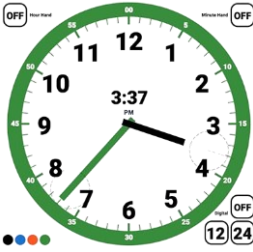
Interactive analogue clock